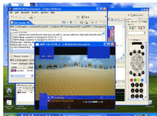
SDK 2.2 Software Development Environment

Additionally to the information, education and technical support service, Osmosys opens its product line - the "Osmosys applications portfolio" to third party applications developers who can promote and sell their own interactive developments through the worldwide Osmosys sales and marketing channels.